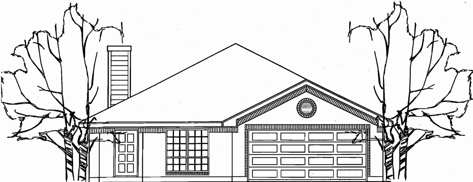
FRONT ELEVATION 'A' 1/8" = 1'0"