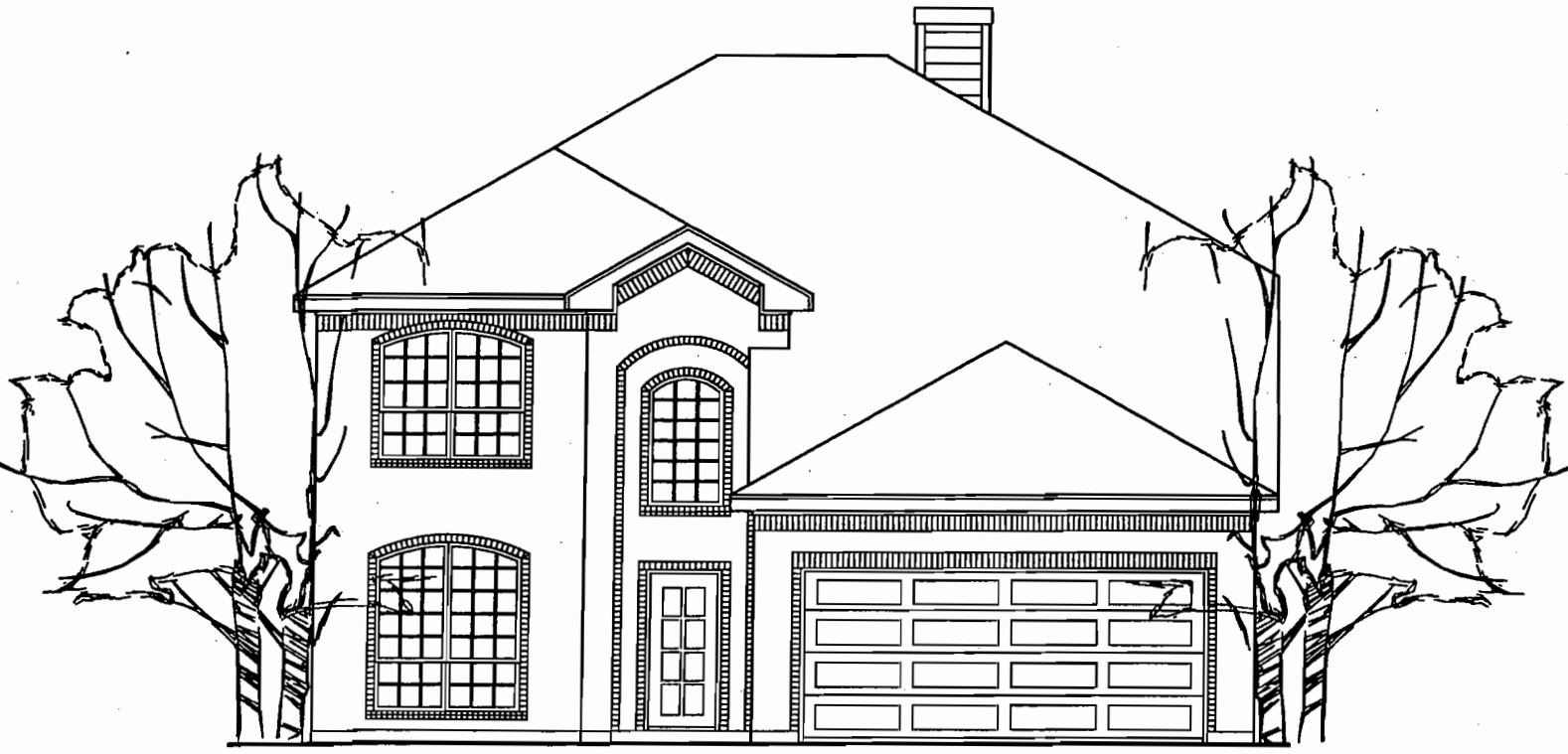
FRONT ELEVATION "B" 1/8"=1'0"