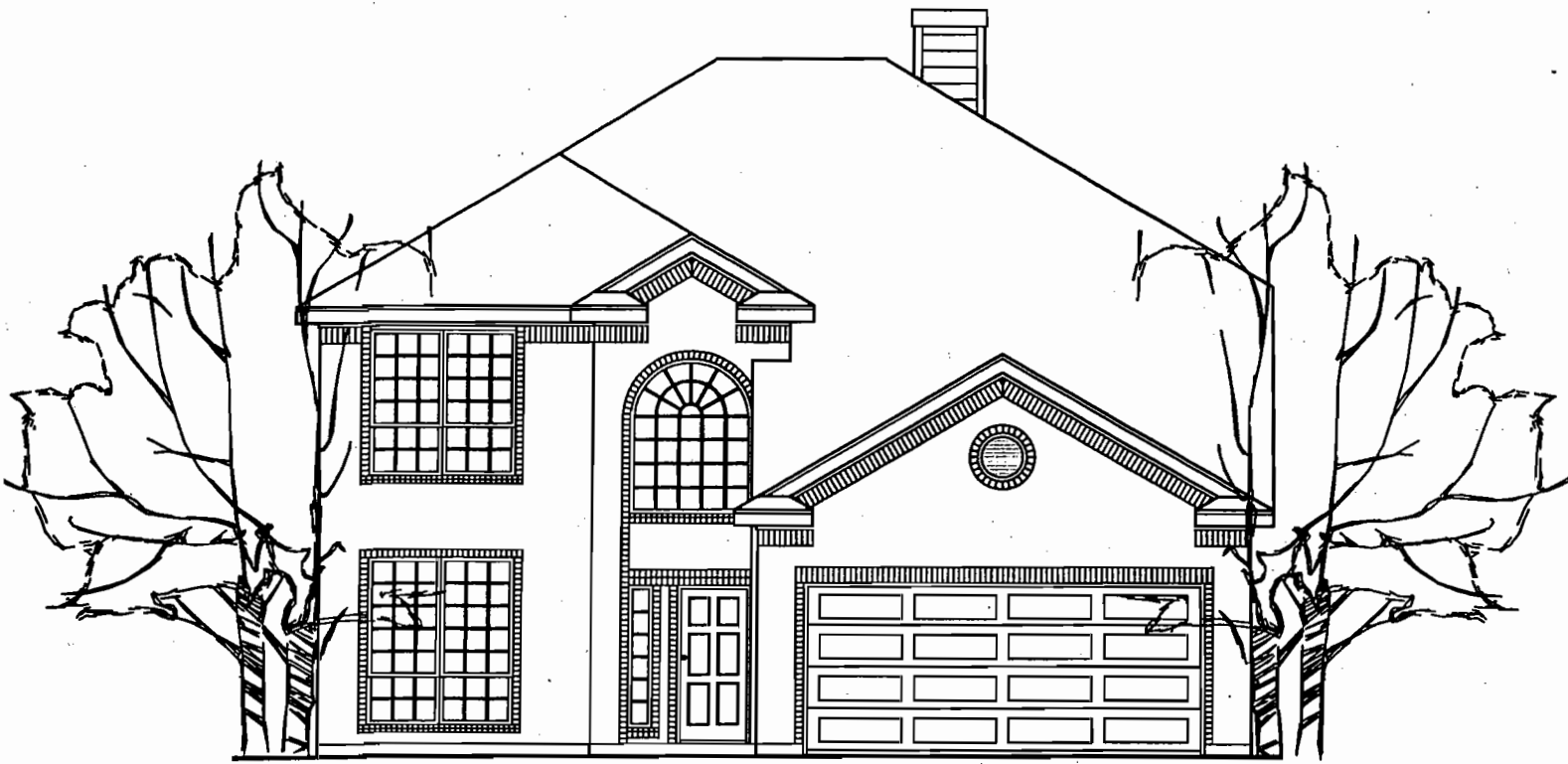
FRONT ELEVATION "A" 1/8"=1'0"