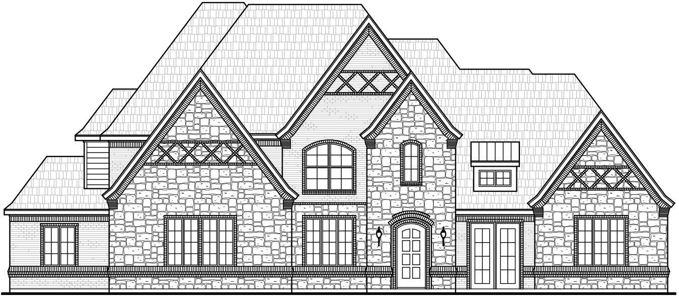
ASPEN - FRONT ELEVATION