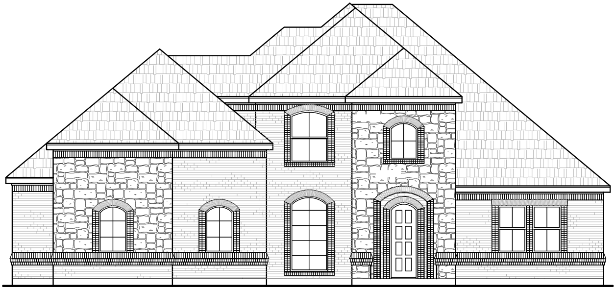
BRECKENRIDGE - FRONT ELEVATION