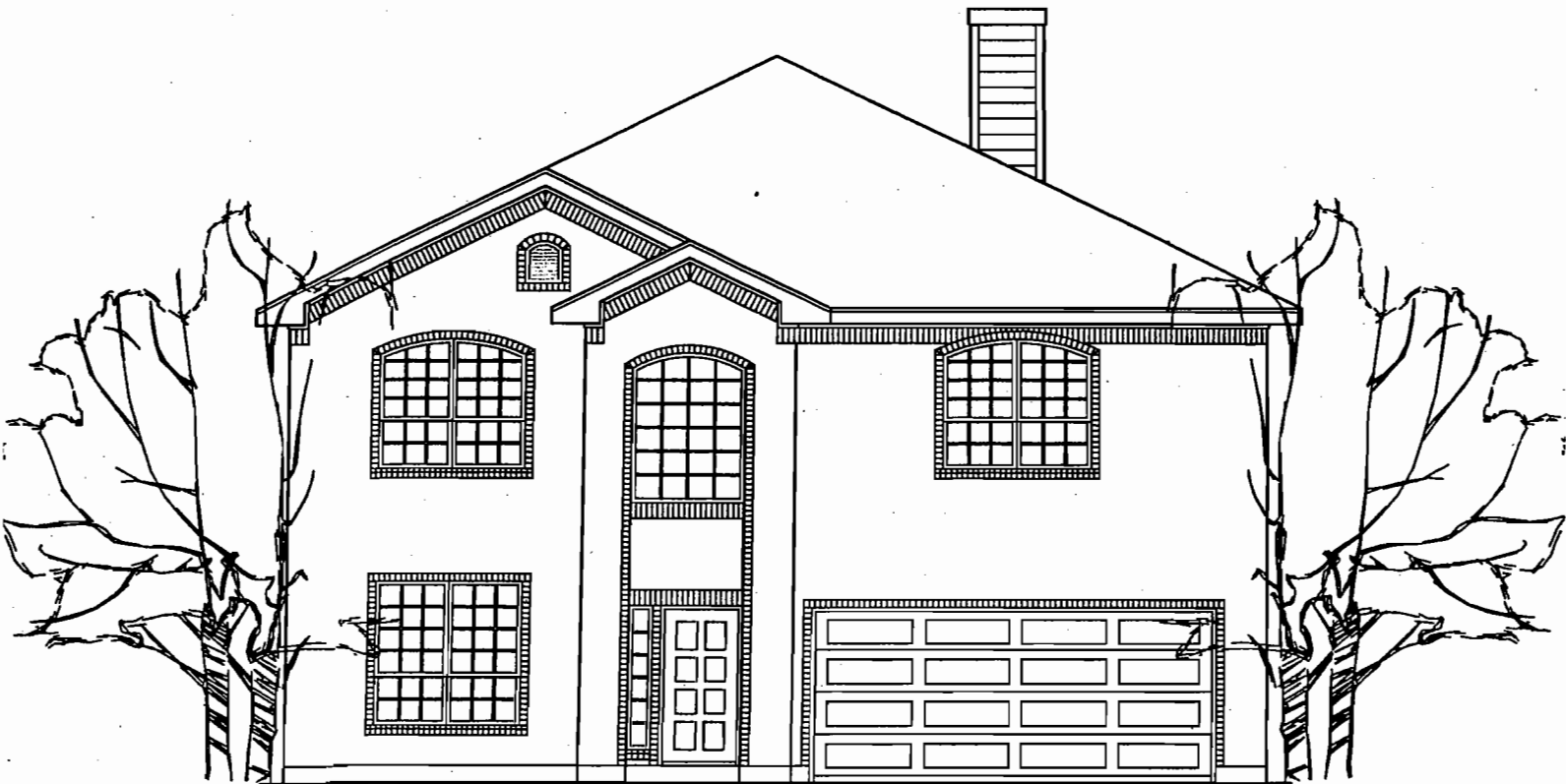
FRONT ELEVATION "B" 1/8" = 1'0"