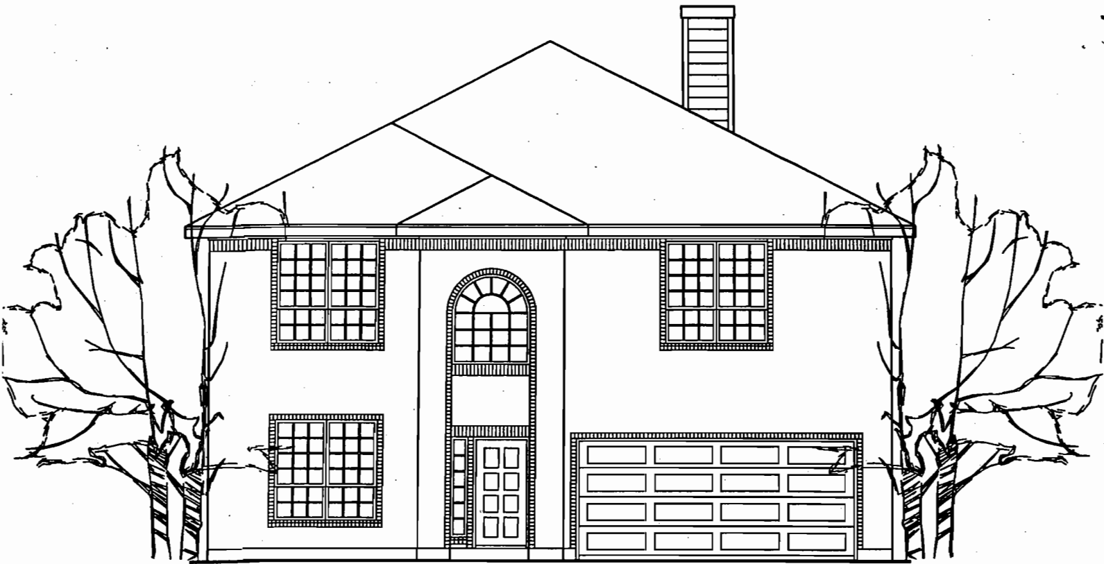
FRONT ELEVATION "A" 1/8" = 1'0"