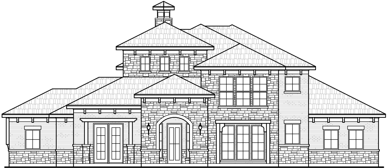
KEYSTONE - FRONT ELEVATION