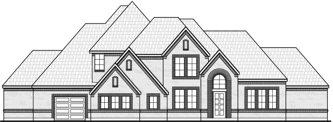
TRINIDAD - FRONT ELEVATION Ø2173